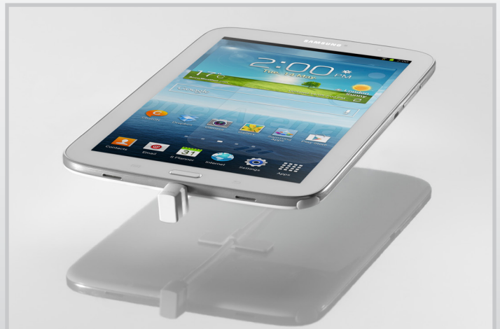
180° Micro USB Sensor