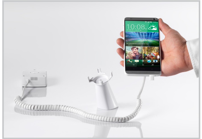
Power w/ Screamer Sensor